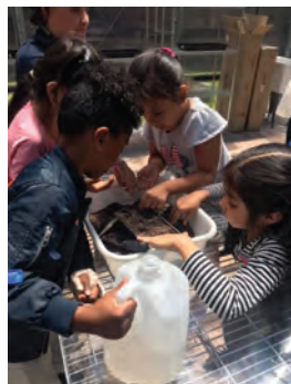
Woodsie Elementary School Greenhouse: opened 2019, funds raised via community coalition