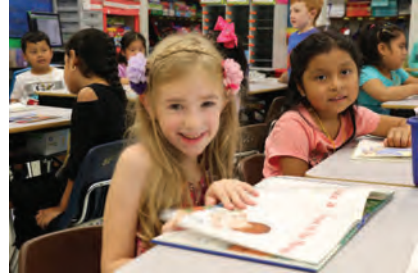
Students at work in Peekskill Middle School and Woodside Elementary