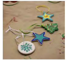
2018 Holiday Ornament Painting & Pottery Show at The Peekskill Clay Studios